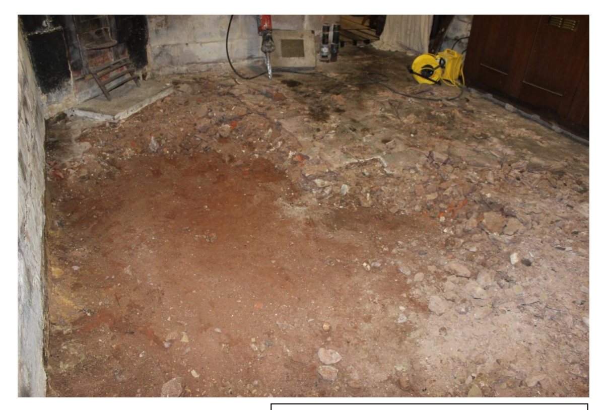
Plate 2: Breaking up the concrete floor

4.6 No further excavation was required and the tomb has been left intact.