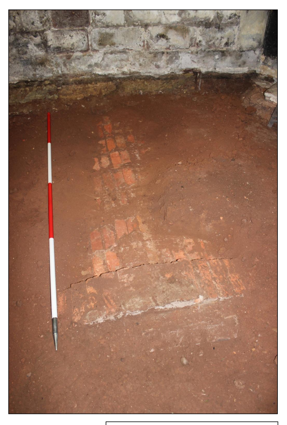
Plate 6: Tomb, viewed from the west