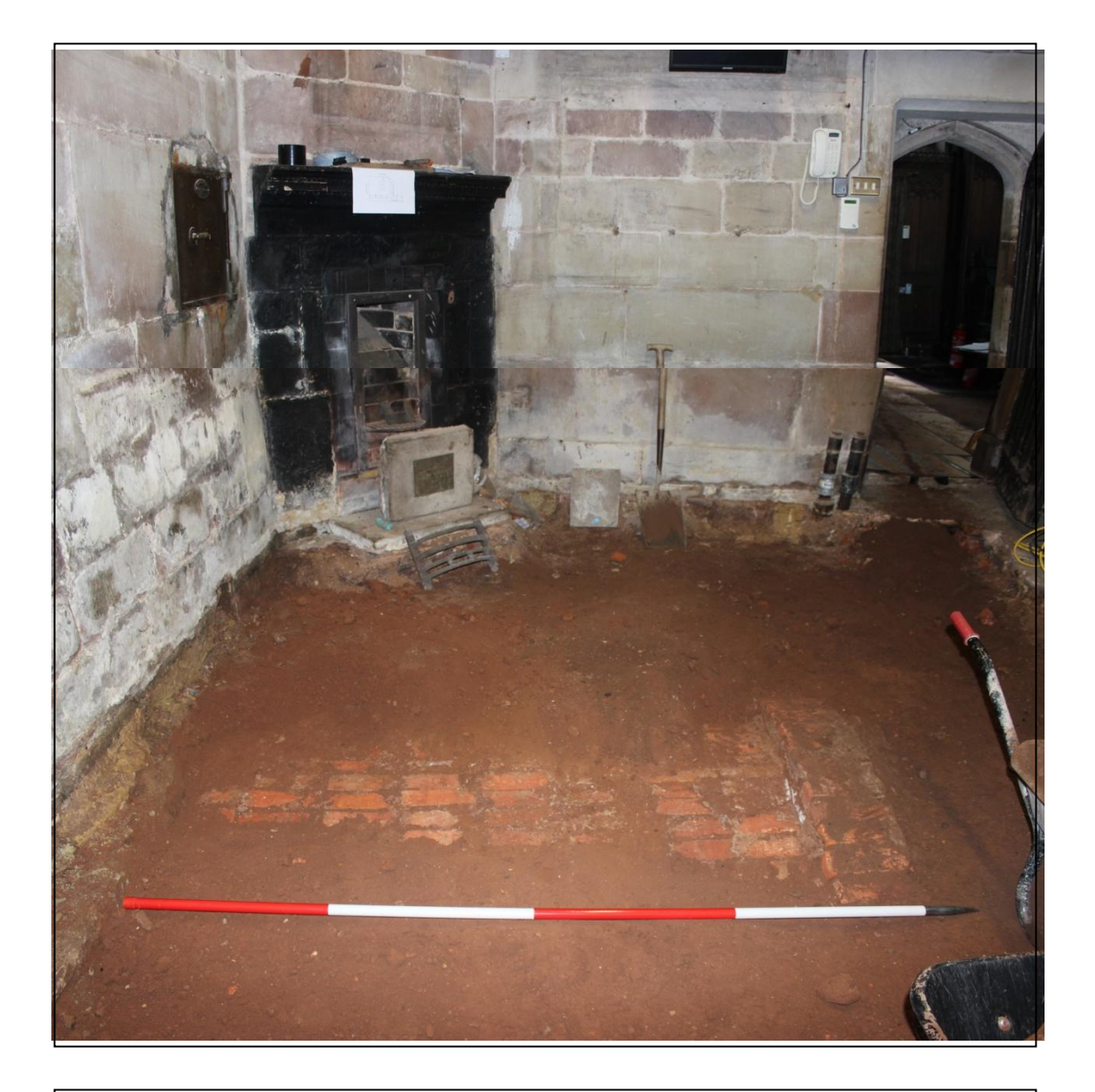
Plate 5: Tomb occupying central position with the Vestry, viewed from the north